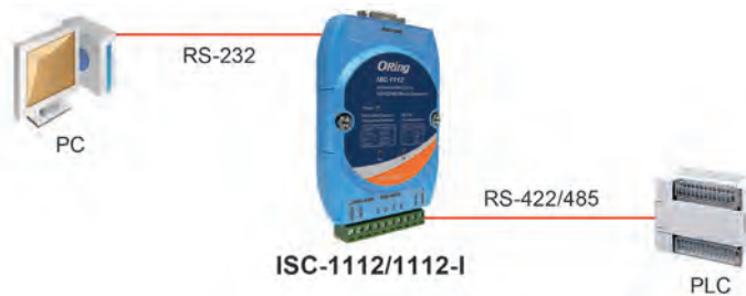
Connections of Serial Media Converter

ISC-1112 series are industrial media converters provide media conversion between RS-232 and RS-422/485 interface. ISC-1112 series are ABS housing design and supporting an operating temperature of -10 to 70°C. The RS-485 control is completely transparent to the user and software written for half-duplex operation without any modification. ISC-1112-I opto-isolators provide 3000VDC of isolation to protect the host computer from destructive voltage spikes. Therefore, the ISC-1112 series is reliable serial media converter and can satisfy most demand of operating environment.